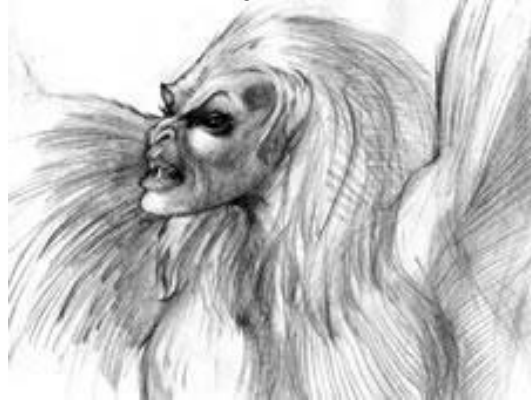
One of the harpies (group of women)

“That’s the ugly man who hurt me,” I cried, pointing at him. “Why did you stomp on me?!”